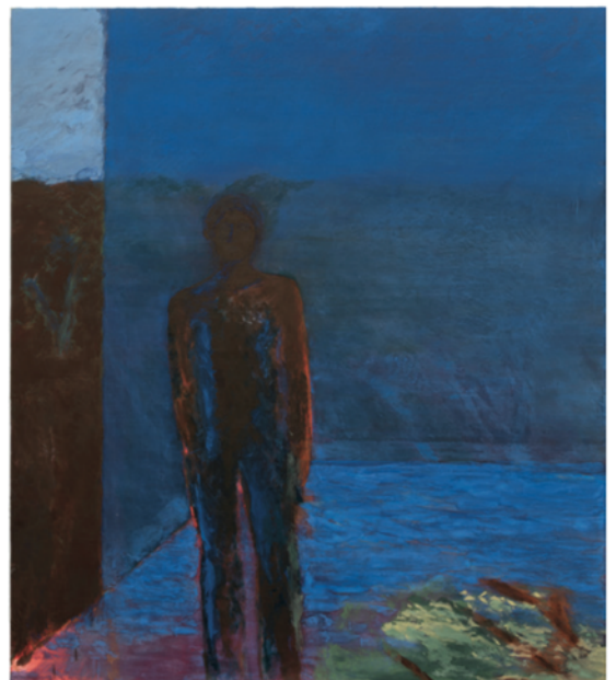
Le Soleil tout le jour a brûlé , 2023 Huile sur toile, 195 x 171 cm Oil on canvas, 76.8 x 67.4 in.