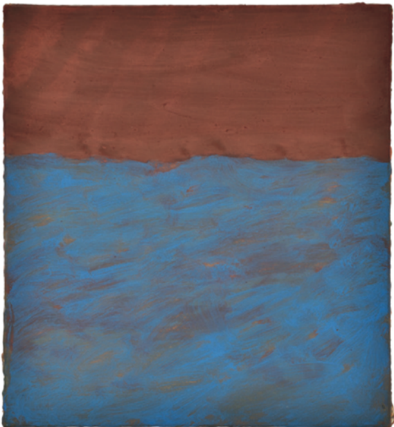
Horizon , 2022 Huile sur toile, 35 x 32 cm Oil on canvas, 13.8 x 12.6 in.

Christine Safa's canvases escape flatness in a different way. Dominated by relief, heavily charged with pigments of intense colours, thickness and substance, they express the imprint (a mix of memory and a mental image) of a powerful moment and a lasting emotion. However, this physical relief is not incompatible with a certain restraint in the figurative expression of people, bodies and landscapes.