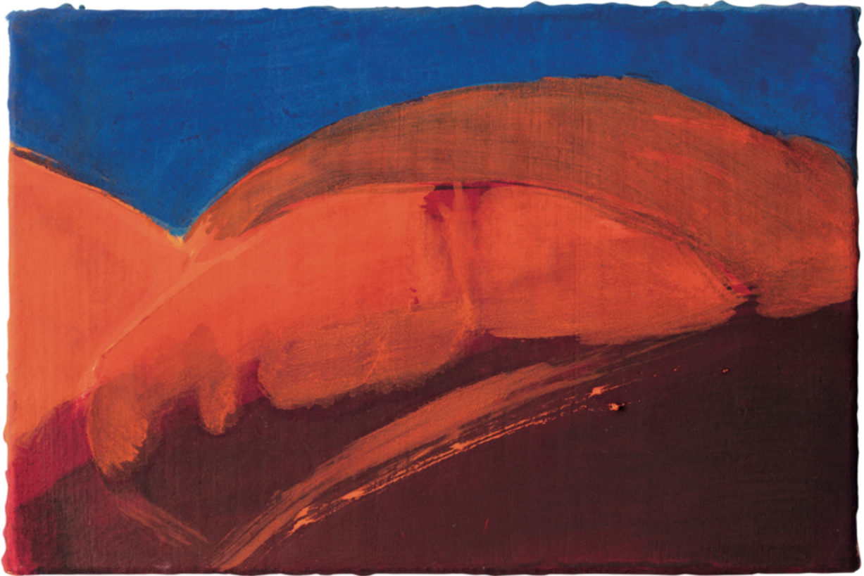
Le Soleil brûlant un côté de mon visage, 2020 Huile sur toile, 16 x 24 cm Oil on canvas, 6.3 x 9.5 in.

Perfectly aware of the transience of time, Christine Safa tends to provide a memory for what is doomed to erasure, to disappearance. The paint becomes stone. The ephemeral finds itself sealed, “imprisoned” in the surface.