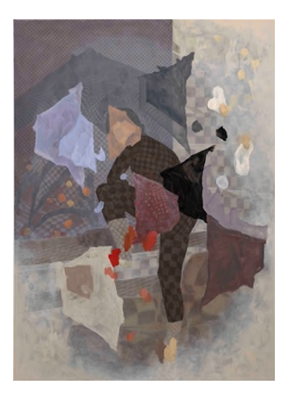
Escapism, 2024 Oil and inkjet on canvas 70.9 x 51.2 in. / 180 x 130 cm