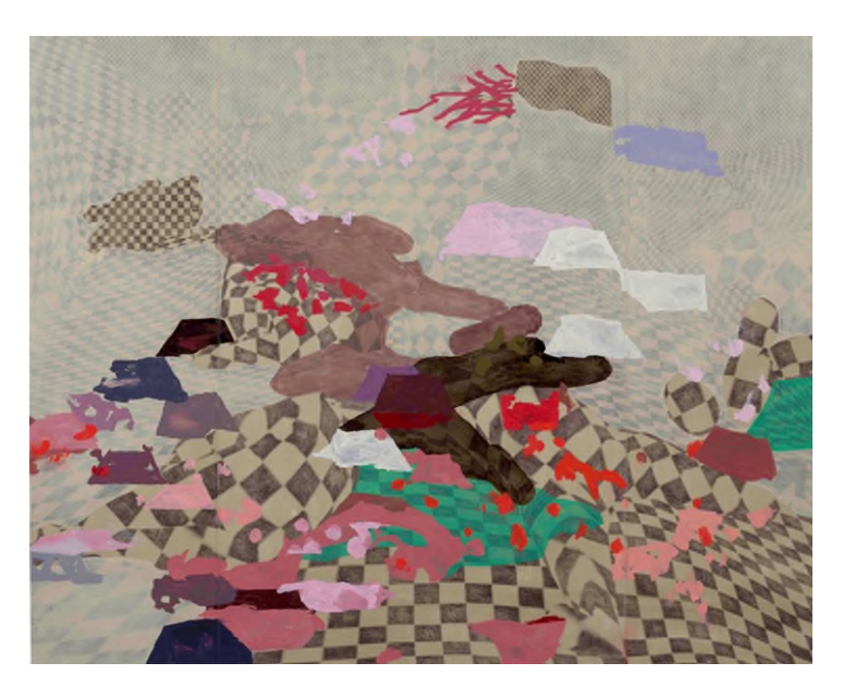
Exhausted symbols, 2023 Oil and inkjet on canvas 78.8 x 98.4 in. / 200 x 250 cm

"These days, the entire surface of reality is mapped, encoded and transmitted in real time to every point and every place. Everything is pure visibility. Does this make everything legible and intelligible? Certainly not! The role of the investigator, the forensic scientist or the artist today is, for example, to play on both aspects, the gap and the trace (the palindromic pair of écart/trace in French): by standing back, parting the integuments of the real, they exhume their memory, movements and lines, the better to understand their hidden foundation, evolutions and realities. The exercise is as perilous as it is vertiginous, and it is particularly enlightening. As Ziegler's work demonstrates."