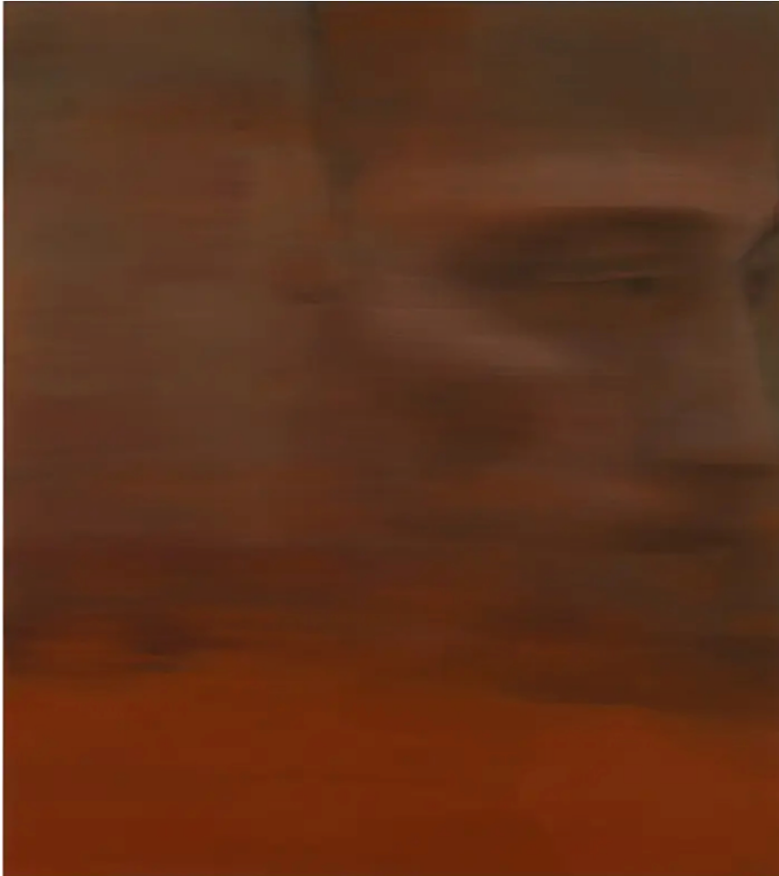
Two officials oversee Chernobyl's catastrophe, 2025 Oil on canvas 51,2 x 45.3 in. / 130 x 115 cm

« It is as though erasure were the only way to combat the emotional forgetting that history can engender: we are moving towards abstraction, but something holds us back. A face. »