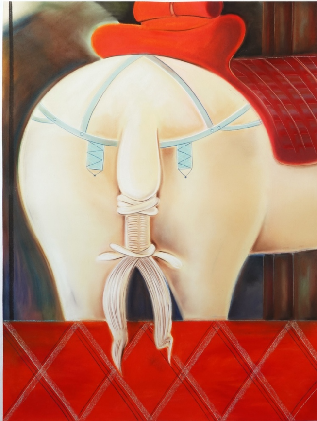
Patterns (big horse), 2025 Soft pastel on paper, 63 x 47.3 in. / 160 x 120 cm

« Pastel is a porous medium; it occupies that shifting space between drawing and painting in which we love to do all kinds of experiments: it allows us to work with our fingers on large formats, in direct contact with the body.