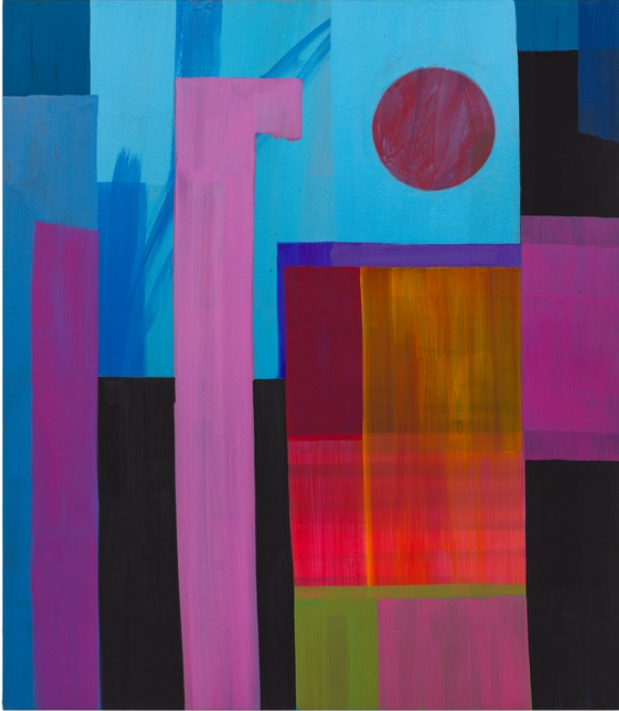
New York alone I , 2026 Acrylic on canvas 48 x 42 in. / 121,9 x 106,7 cm

« My paintings primarily speak of love, empathy, and fleeting moments of belonging. My experience is unique, and I convey it through painting. In my practice, it is impossible for me to separate myself from the artwork: they are one.»