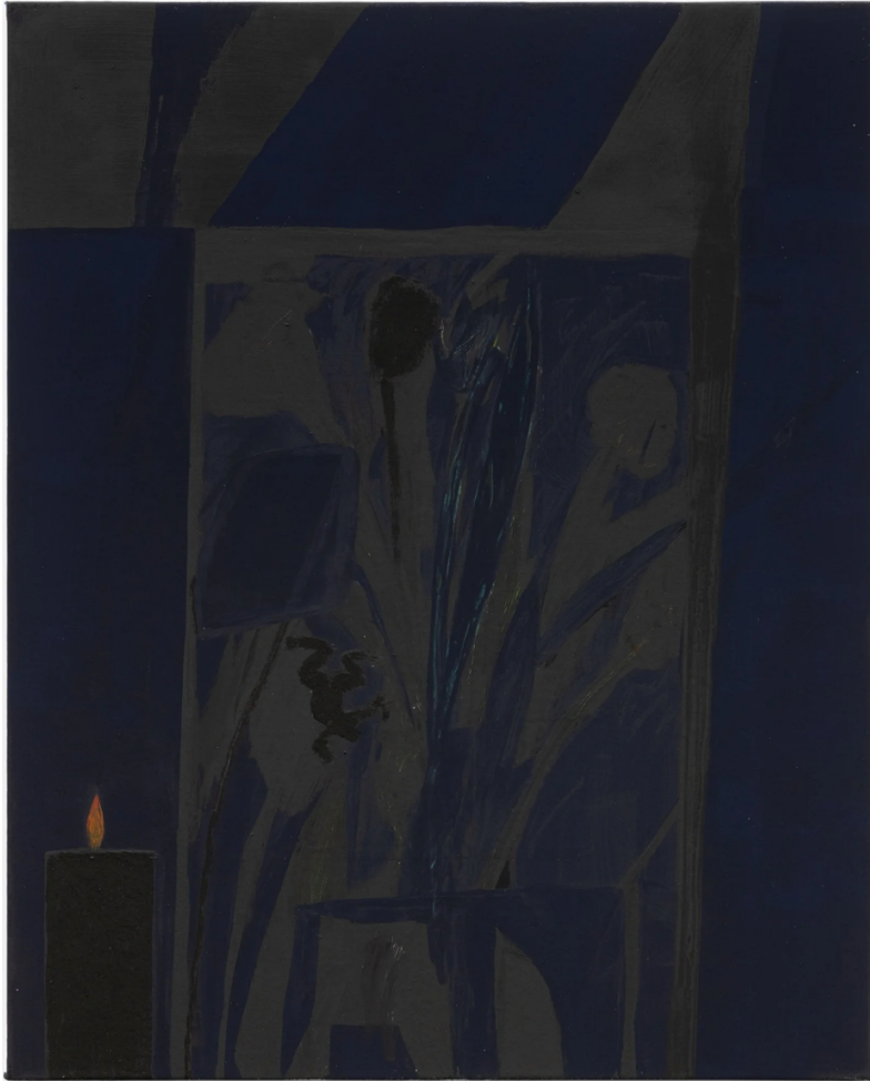
End of April beginning of May II, 2023 Acrylic on canvas 28.8 x 24.1 in. / 73,3 x 61,5 cm

« Indeed, darkness —across colour and light conditions, but also humour— is integral to her practice. Parsons' works are frequently anchored by a predominance of black and seem to reveal themselves in the shadows, as if slowly divulging secrets. The works call upon the body's multisensory awareness, as when our visual acuities are diminished at night. Figures emerge from the darkness, edges become discernible, senses are heightened. These are paintings that gently and surreptitiously take hold of you, meet your gaze and reveal themselves.»