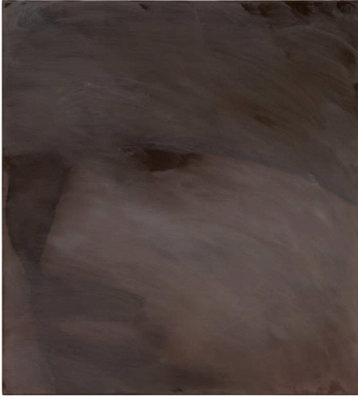
Invasion de la Finlande, 1939 Prisonnier Russe, 2025 Oil on canvas 29.5 x 26.8 in. / 75 x 68 cm

« I cannot paint oppressors or the oppressed in a neutral way. You don't paint a Nazi prisoner in the same way as any other subject. Black and white is a conscious statement. The statuesque treatment, the symmetrical lines, for example. There is also a sense of respect in indicating what we are looking at and where it comes from. My titles are often very descriptive, scientific: Russian Prisoner in 1944. These are very serious images. It's almost a way of responding to today's geopolitical events and, thus, trying to prevent history from repeating itself. »