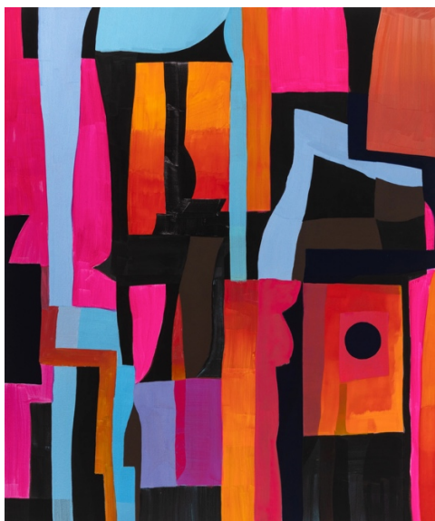
Pain I, 2023 Acrylic on canvas 72.1 x 60.1 in. / 183,1 x 152,7 cm