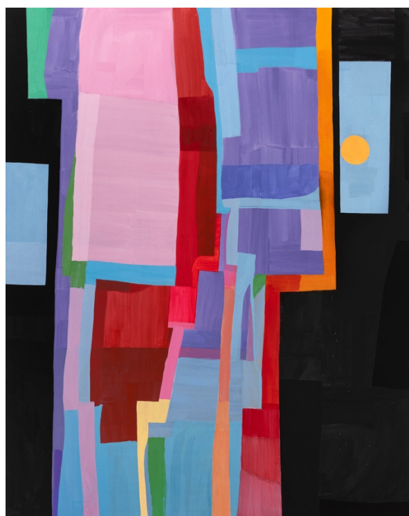
New York, 2023 Acrylic on canvas 100.1 x 80.1 in. / 254,3 x 203,5 cm

« Architectural and urban forms are layered in overlapping geometries, their rectilinear force tempered by the softer contours of a human body glimpsed in silhouette against a coloured background, or the perfect circle of the moon veiled against the night sky. The works convey at once the vibrancy and loneliness of big city life.»