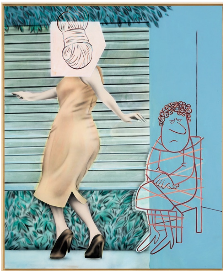
Bebop , 2022 Acrylic and ink on canvas 66.5 x 55.1 in. / 169 x 140 cm

« What could beat reshuffling the pack as a light-touch way of lifting the veil on the implicit, the unspoken, the roles and codes that are all the more commonly accepted for being arbitrary? And at the same time, in a playful farandole, it unleashes the pleasure of knowledge, the search for meaning and the aspiration to equality, united by humour, that direct-access complicity. »